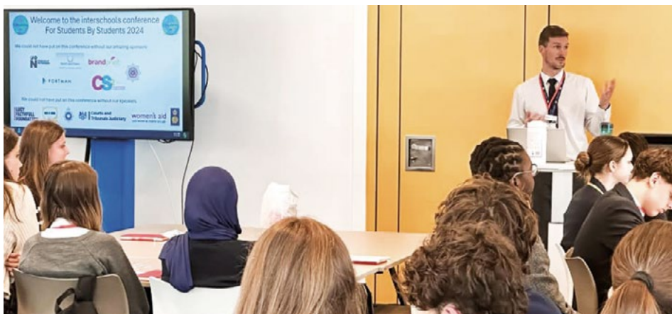
Pupils from Quinton House School organised an inter-schools conference

"...I am delighted that we are able to financially support our community groups..."